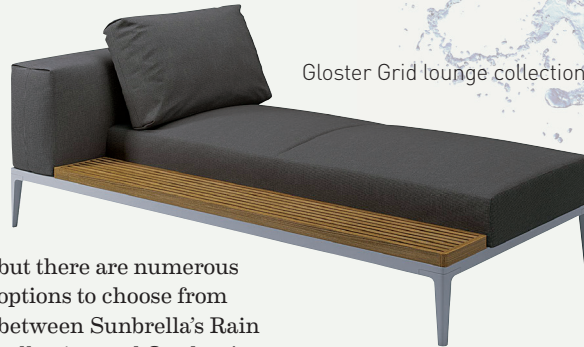
Gloster Grid lounge collection